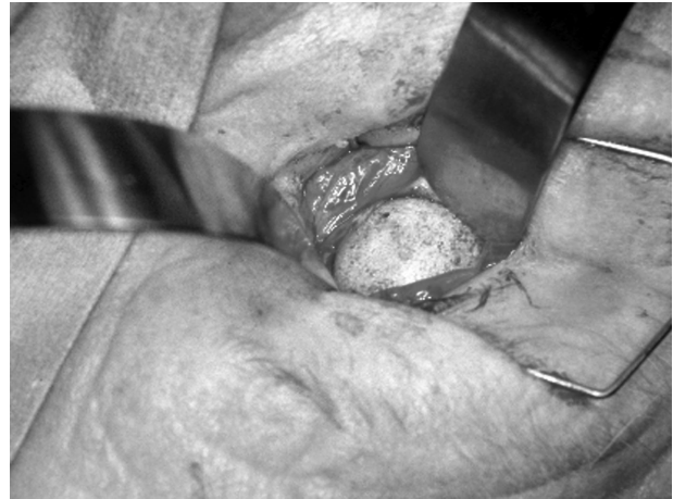
FIG. 3. Orbital sizing set was used to determine needed orbital volume; appropriately sized multipurpose conical porous polyethylene orbital implant was placed in the scleral pocket after being soaked in antibiotic solution.